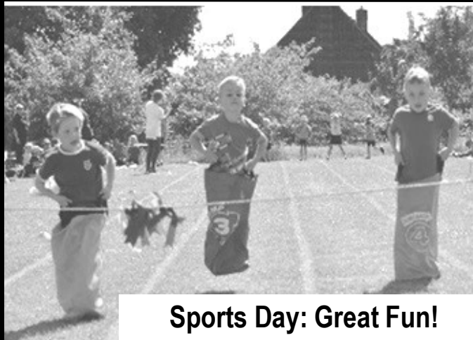
Sports Day: Great Fun!